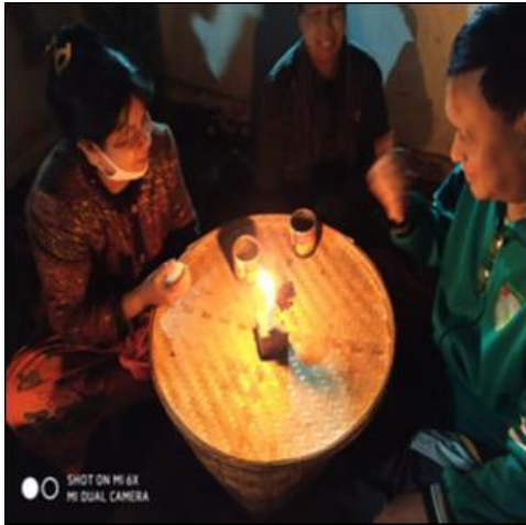
Procedure of Egg-Tapping Game