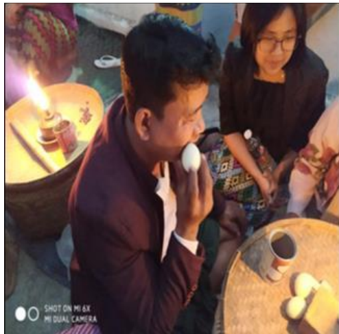
Procedure of Egg-Tapping Game