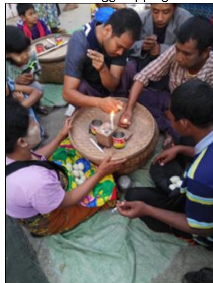
Procedure of Egg-Tapping Game