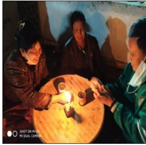
Procedure of Egg-Tapping Game