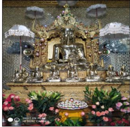
Jinamanaung Lokachanthar Bronze Buddha