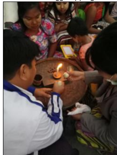
Procedure of Egg-Tapping Game