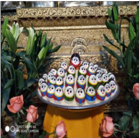
Donate duck eggs to the pagoda