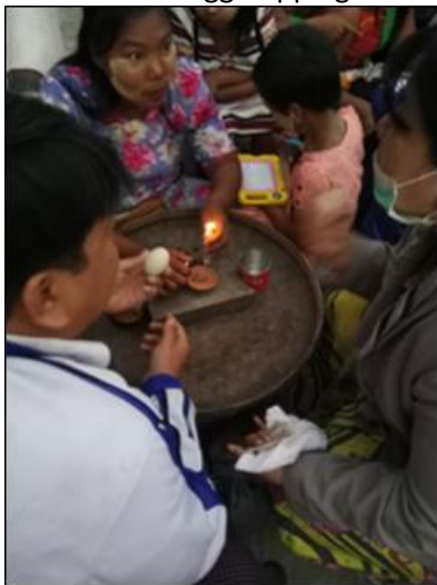
Procedure of Egg-Tapping Game