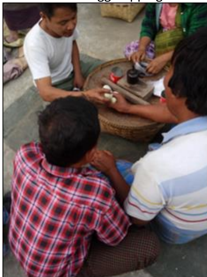
Procedure of Egg-Tapping Game